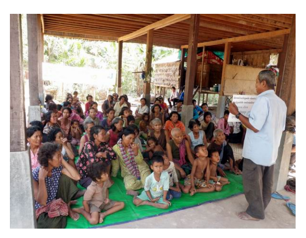
Health education at health center

We have conducted many health education workshops at health centers where VHVs have learned about many types of disease. These VHVs are practicing to transfer their knowledge to villagers. Their achievements are fully utilized at village health education. During the first education course, some of the VHVs are so nervous as to forget what to talk about. Nevertheless, the VHVs have important roles of promoting health condition