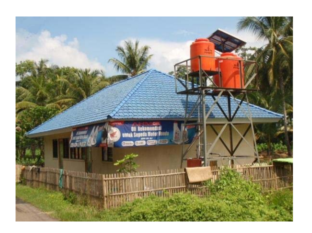
A newly installed solar operated well By Mika Ito

Member's Voice: Why contribute to society? Why make donation? By Norio Watanabe