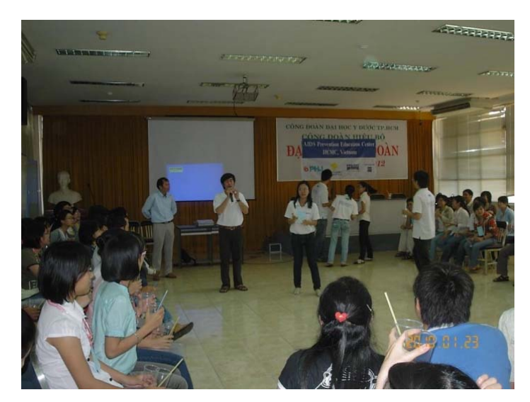
AIDS prevention practical training using games