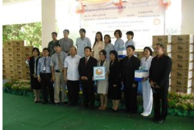
Donation ceremony attended by reps. of Unicharm (Thailand), recipients, and PHJT