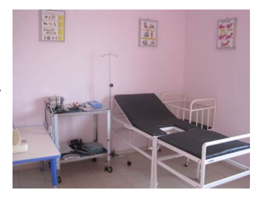
Baby delivery room at village health center

PHJ proposed the provincial health department to increase midwives who would reside in villages and conducted health education to promote delivery with the help of midwife and at medical facilities. PHJ has also been supporting the establishment of a 24 hour operating baby delivery room at health clinics as well as construction of health centers in villages. In fiscal year 2009, we achieved zero maternal mortality rate.