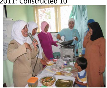
Nutrition education as part of maternal and child health program (ongoing)