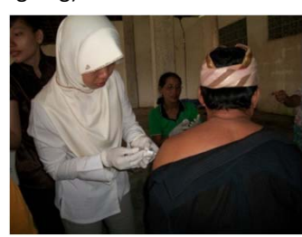
2009 Bird flu, rabies and other infectious Diseases prevention education (ongoing)