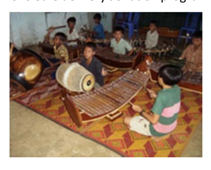
2009 Donation of traditional Cambodian Music instruments