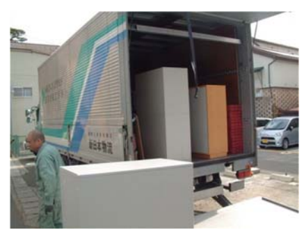
Furniture delivered to Komatsu Clinic December 9