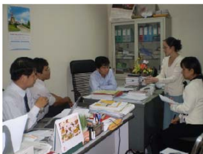
Meeting at UMP