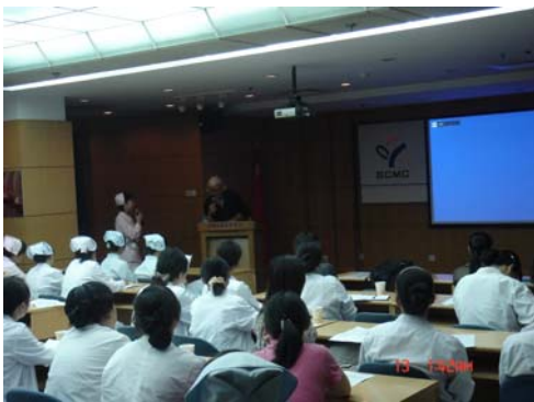
Mental care seminar at Shanghai Children's Hospital

Donations we received from you are used in training the nurses of this hospital in mental health care at Shanghai Children's Hospital and jointly producing special manuals and DVDs with the Shanghai Hospital.