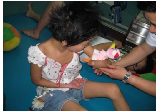
Rehabilitation of seriously injured child